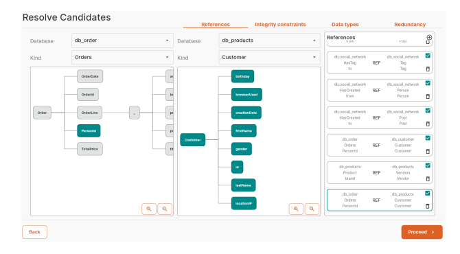
Figure 4: MM-infer – Modification of Candidates (left = referencing property, middle = referenced property, right = list of all candidates for references)

In our demo of MM-infer , we build two use cases around (1) a structurally rich multi-model scenario from UniBench depicted in Fig. 1, even extended to demonstrate all interesting cases, and (2) simpler but real-world data from IMDb^{10} transformed into multiple models (i.e., relational, graph, and document). We will gradually go through the inference process, i.e., (1) choice of