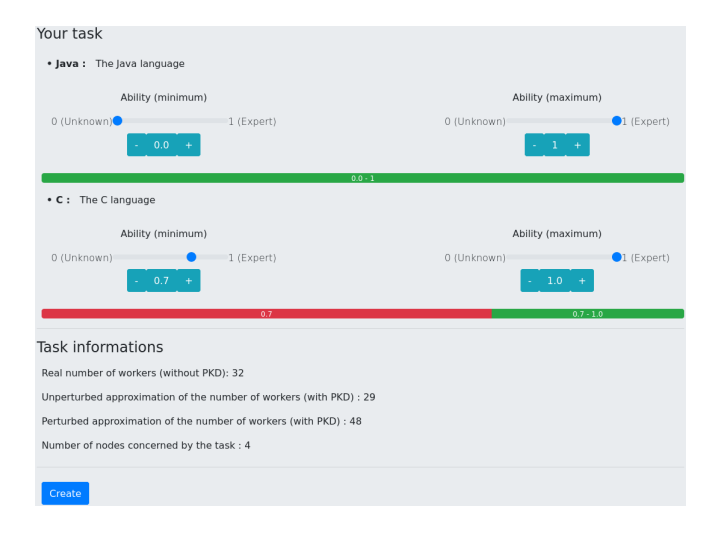
Figure 4: Tuning the task with information from the hierarchy of partitions. On the first half of the screen (top), the skills requirements of a task are being tuned over the Java and C programming skills (the union of the leaf partitions appears on the green lines, and neighboring nodes appear on the red lines). On the second half of the screen (bottom), the screen displays information about the perturbed and actual number of workers corresponding to the task requirements.

where each screen is dedicated to a specific step of the execution sequence. First, an introduction screen presents the demonstration and its objective. Second, the audience choses the set of skills to consider. Third, the audience can launch the workers import (according to the various methods described above, including the import of a CSV file from the audience). Additional information about the distribution of skills within the dataset chosen is displayed through a Notebook document and commented. Fourth, the PKD algorithm is executed on the population of workers defined and outputs the space partitioning computed. Finally and most importantly, the audience uses our simple task tuning helper in order to tune a few tasks (1) without any information on the underlying population (default method within privacy-preserving crowdsourcing platforms) and (2) with the hierarchy of partitions computed by the PKD algorithm. Figure 4 shows the screen dedicated to tuning the task with information from the hierarchy of partitions. Optionnally, in order to observe the privacy/utility tradeoff, the audience is invited to explore the hierarchy of partitions and inspect the impact of the differentially private perturbation by comparing the perturbed counts to the exact unperturbed number of workers within each partition.